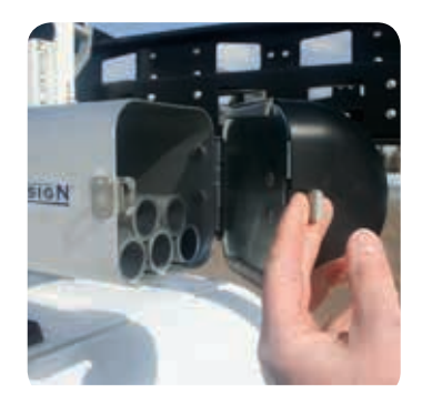
Steel reinforced cap helps secure contents